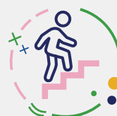
Walking, climbing stairs, or kneeling